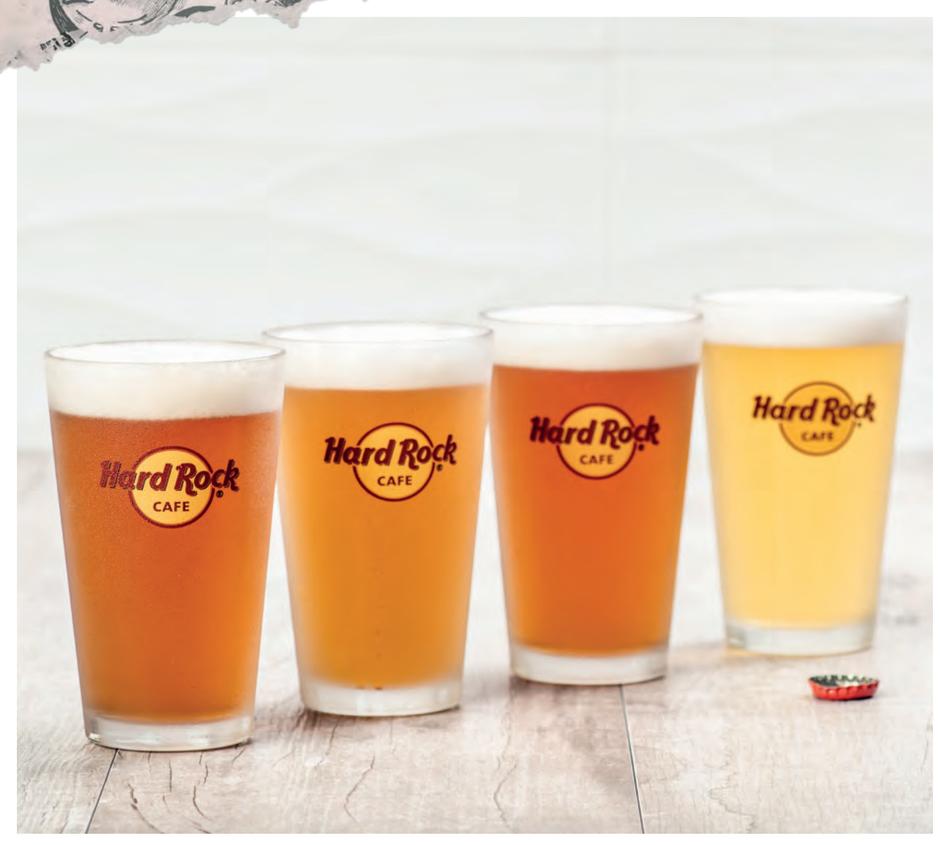
Prices are quoted in US Dollars and subject to additional 10% Service Charge and 12% Government Taxes.